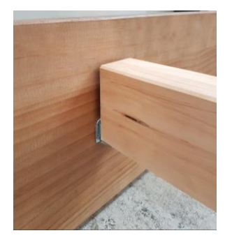
Centre Rail in place