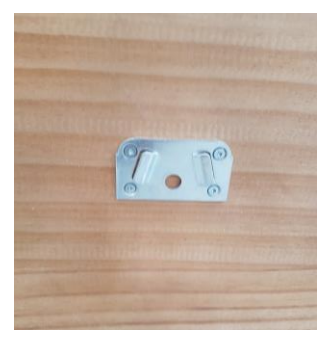
Centre Rail Bracket

5. Place the centre rail into the Bedframe